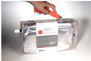
Fig 3. 3.6kg cartridge

The FullCure720 , a transparent rigid material, is suitable for a broad range of rigid models, particularly where visibility of liquid flow or internal details is needed. The material is also biocompatible and suitable for various medical applications.