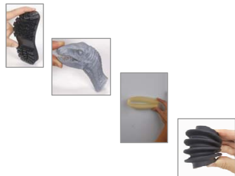
Fig. 9. The Tango Series

The FullCure® 6XX materials are designed especially for the unique requirements of Hearing Aids (ear molds): Clear - FullCure630; RoseClear - FullCure655; SkinTone - FullCure680. With this group of materials, Objet is taking a great step forward towards rapid manufacturing.