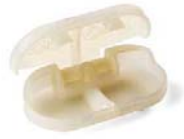
Fig.6.FullCure430 DurusWhite Model