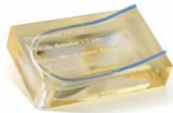
Fig. 4. FullCure720 Transparent Model

Its main characteristics are: Tensile Strength: 60.3 MPa, Elongation at break: 15–25%, Modulus of Elasticity: 2,870 MPa, Flexural Strength – 75.8 MPa.