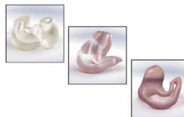
Fig.10 . The FullCure 6XXX series

The FullCure® 6XX materials are designed especially for the unique requirements of Hearing Aids (ear molds): Clear - FullCure630; RoseClear - FullCure655; SkinTone - FullCure680. With this group of materials, Objet is taking a great step forward towards rapid manufacturing.