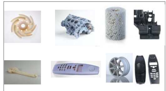
Fig. 5. The Vero Series

VeroGray specifically features an excellent detail visualization and dimensional stability. These characteristics make this modeling material the best choice for models in transit