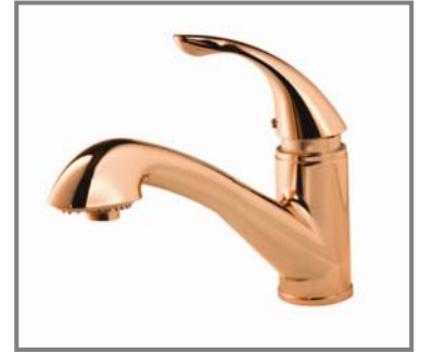
4. First coating of model with copper

Automotive, appliance, military, marine, trucking, electrical and construction are some of the markets in which metal coating is found. Metal coating can be applied to parts such as fasteners, brackets, clips, clamps, stampings, beams and rotors.