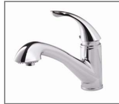
5. Final metal coating by nickel