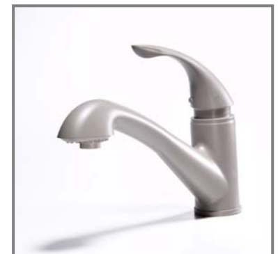
3. Metalizing the Objet model with a conductive surface