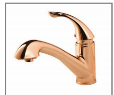
4. First coating of model with copper