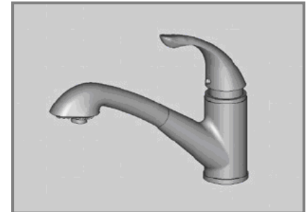
1. Faucet model design by CAD

The plating bath is the final bath of the preplate cycle. A thin deposit of metallic file is deposited on the Objet part. It can be made of nickel or copper depending on the objects application. Electroless plating helps electroplated parts in a corrosive environment.