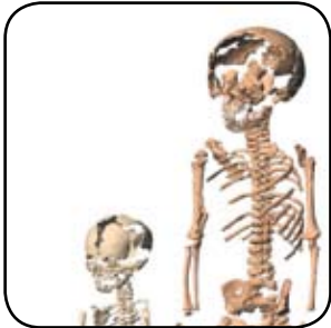
Left: Mezmaiskaya Right: Dederiyeh 1