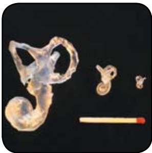
To better understand anatomy structure, inner ear fossils are scanned and printed to reveal details otherwise invisible to the human eye (middle and right: original size)

All these findings are worth little if they cannot be shown to the interested public. "It may be trivial but nevertheless it is crucial!" commented Prof. Zollikofer. "Objet replicas of the fossils can be displayed at exhibitions and museums across the globe. This would be simply impossible with the original fossil because its uniqueness and fragility don't allow the part to be easily moved."