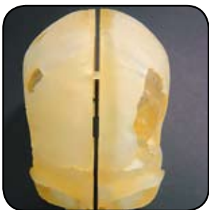
A printed replica fossil skull prepared for silicon moulding