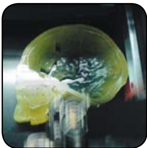
Printing of a replica fossil skull