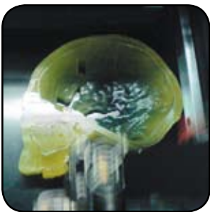
Printing of a replica fossil skull