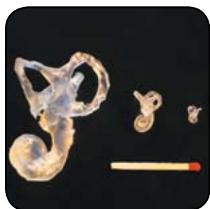
To better understand anatomy structure, inner ear fossils are scanned and printed to reveal details otherwise invisible to the human eye (middle and right: original size)

All these findings are worth little if they cannot be shown to the interested public. "It may be trivial but nevertheless it is crucial!" commented Prof. Zollikofer. "Objet replicas of the fossils can be displayed at exhibitions and museums across the globe. This would be simply impossible with the original fossil because its uniqueness and fragility don't allow the part to be easily moved."