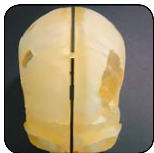
A printed replica fossil skull prepared for silicon moulding