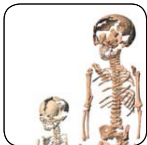
Left: Mezmaiskaya Right: Dederiyeh 1