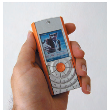
Final model painted for feasibility testing.

©2007 Objet Geometries, Ltd. Objet™, Objet Geometries™, PolyJet™, Eden250™, Eden260™, Eden350™, Eden350™, Eden350V™, Eden500V™, Eden™, SHR™, PolyLog™, QuadraTempo™, Objet Quadra™, FullCure® and Objet Studio™ are trademarks of Objet Geometries Ltd. and may be registered in certain jurisdictions. All other trademarks belong to their respective owners.