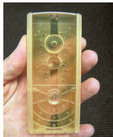
Model printed on an Eden 3-D printing system.