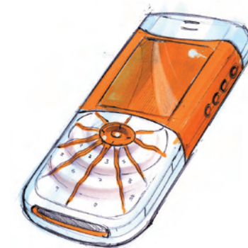
Start from sketch.

Objet Geometries AP Limited 13 Floor, Unit 52A, HITEC, 1 Trademart Drive Kowloon Bay Hong Kong Tel: +852-2174-0111 Fax: +852-2174-0555