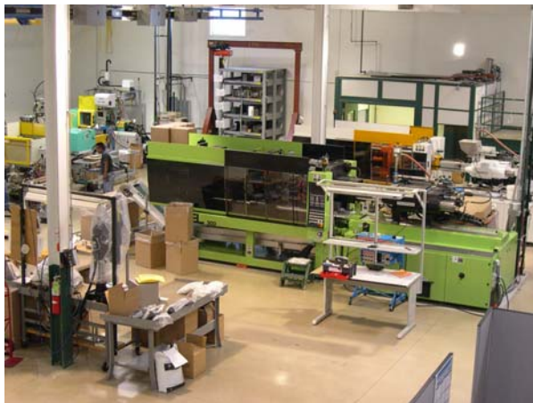
Insert molding has the advantage of using conventional, single-shot injection molding machines.

The plastic substrate and TPE are joined through one of two methods, insert molding or multi-shot molding. The choice of methods is based on a number of factors including production volumes, tooling costs and part designs. In North America, insert molding is more prevalent than multi-shot molding. In Europe, where multi-shot molding originated, the opposite is true. Asia tends to have equal use of both methods.