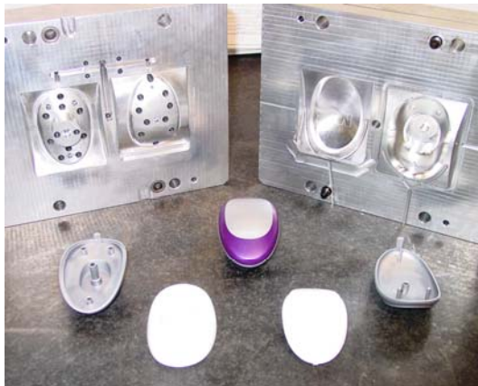
A 1+1 cavity prototype injection mold reduces cost and lead time. One cavity of the tool molds the substrate of the sander handle; the other overmolds the TPE.

To prototype using the insert molding approach, two molds are required. One mold is for the substrate and the other is for the overmold. Alternatively, a “1+1” family mold can be used. This approach uses one cavity of the mold for the substrate and the other for the overmold.