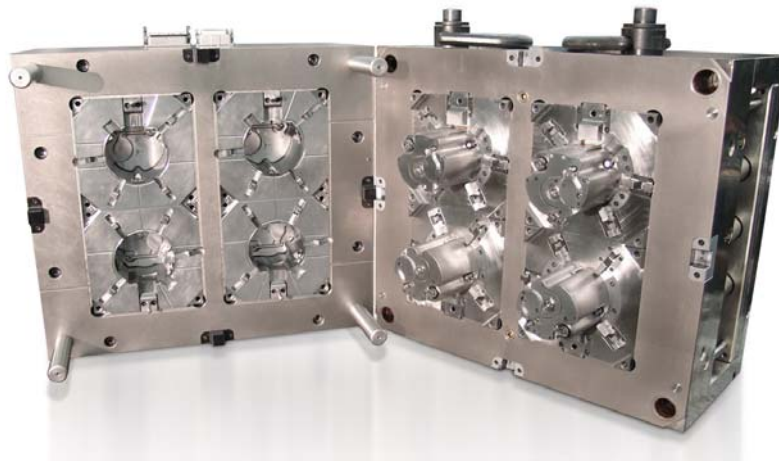
A four-cavity, insert mold for overmolded part production.

In contrast, multi-shot molding is performed on an injection molding press that shoots multiple materials in a single operation. These molding machines incorporate two or more injection barrels and some form of automated part or tool movement. This allows the TPE to be overmolded immediately following the molding of the substrate. Using techniques such as common core, rotary stripper plate, core toggle/core back and co-injection, the part is manufactured in a single, automated operation.