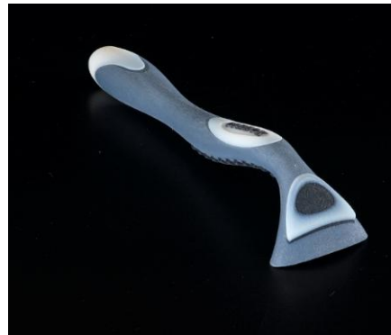
Soft-touch, non-slip surfaces are now common on consumer products such as razor handles.

single part. However, the generally accepted definition of overmolding is the production of an injection molded part that seamlessly combines a rigid plastic with a rubber-like elastomer. The result is the soft-touch, non-slip surface that has become common on power tools, toothbrushes and razors.