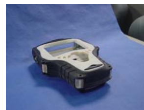
Using a Connex500, a similar device was delivered in only three days for just $2,800.

Using the Connex500, Vista printed the upper and lower housings with a rigid, white material (Shore D 83) and a rubber-like, black material (Shore A 61). The prototype parts were used to evaluate the form, fit, function and feel of the device. According to Dan Mishek, sales manager for Vista Technologies, two sets of the two-piece housing were delivered in four days for a total cost of $4,200. “That was almost the same time and cost as that to make just the patterns for the previous RTV molding job,” he stated.