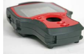
With RTV molding, this handheld device cost $16,000 and took nearly 4 weeks.

Several years ago, Vista Technologies produced prototypes for its client, SPX Corporation, with RTV molding. Recently, SPX engaged Vista to prototype a newly redesigned version of its handheld diagnostic device. This time, the two-piece, overmolded housing was prototyped with Vista’s Connex500 3-D printer.