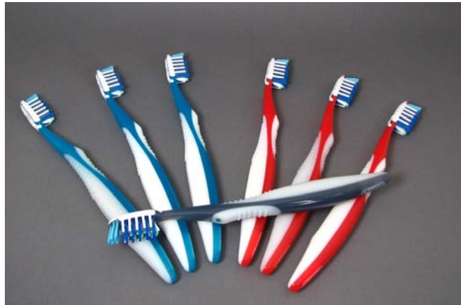
Overmolding offers a distinctive look and feel for consumer products like toothbrushes

Integrating a TPE provides a pleasant, comfortable feel to handheld devices. Designers use overmolded TPEs to offer a distinctive tactile quality to the products they create. With a wide range of available TPEs, the soft-touch handles and grips can be molded with a “spongy,” slip-resistant texture or a firm, protective quality.