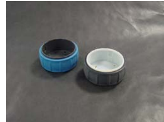
An overmolded meter component (left) and a Connex500 prototype (right) printed in a single operation.

Prior to the launch of the Connex500, Vista Technologies, a rapid prototyping, rapid tooling and injection molding firm, manufactured a low-volume, aluminum tool to produce a small, overmolded part for a meter reading device. Accurate Transformers, LLC needed just 350 parts per quarter, so a simple, manually-operated, insert mold was the ideal solution. The 1+1 aluminum family mold was delivered quickly and inexpensively, costing just $8,900 and taking less than three weeks to deliver.