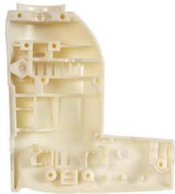
Single-material rapid prototypes, such as this power drill housing, lack the soft touch of an overmolded part

To overcome the one-material limitation, a representation of the overmolded TPE geometry could be hand fabricated and then glued to the surface of the machined model or rapid prototype. Although somewhat limited with respect to the complexity of the design that is possible, this method is common during the earliest days of the product development process. This handcrafted approach is used to make mock-ups for presentation of the product's design characteristics and aesthetic qualities.