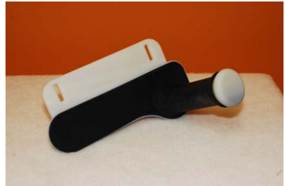
The low cost and rapid delivery of a Connex500 prototype allowed the designer to produce three versions of the workout equipment handle with the properties of an overmolded part.

With the aid of a Connex500, GROWit LLC made the design of workout equipment handles interactive and evolutionary. Its client needed functional prototypes of the overmolded parts to evaluate ergonomics, comfort and visual appeal. Knowing that this would be an iterative process, the client also needed the prototypes to be made fast and affordably.