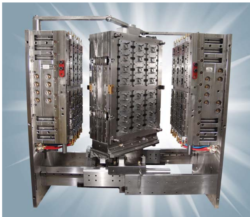
A 24-cavity, rotary stack, multi-shot tool automates molding of substrate and TPE

In contrast, multi-shot molding is performed on an injection molding press that shoots multiple materials in a single operation. These molding machines incorporate two or more injection barrels and some form of automated part or tool movement. This allows the TPE to be overmolded immediately following the molding of the substrate. Using techniques such as common core, rotary stripper plate, core toggle/core back and co-injection, the part is manufactured in a single, automated operation.