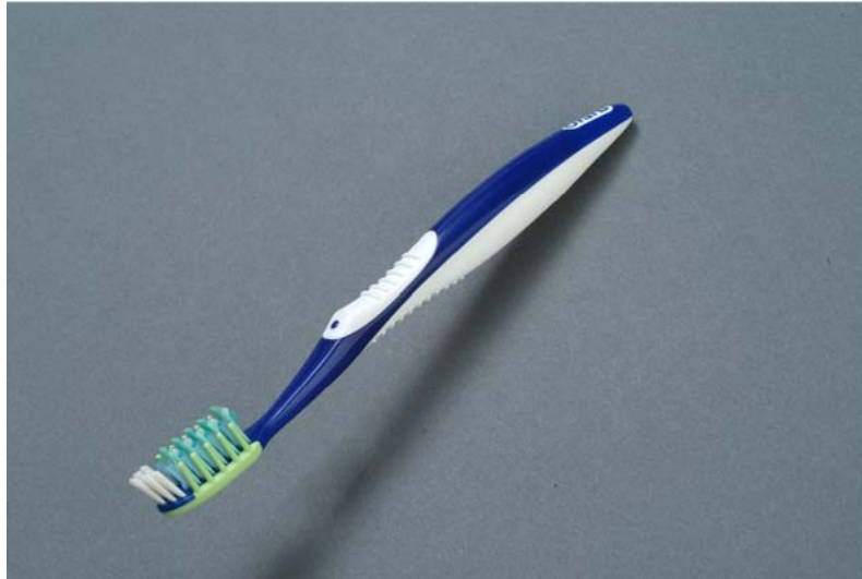
Tooling for an overmolded toothbrush will range from $10,000 to $300,000

Tooling is expensive for even a small overmolded object, such as a toothbrush, as shown below.