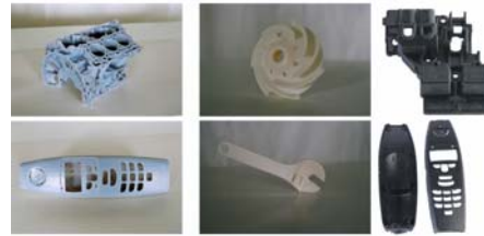
Fig. 4. The Vero Series

VeroBlack, the range of colours also enables numerous applications in different industries. For example, VeroBlack enables consumer electronics manufacturers to simulate the look of black end-products without painting.