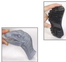
Fig. 3. The Tango Series

TangoBlack provides maximum elasticity, while TangoGray is a slightly harder, yet flexible material that provides a more controlled flexibility and elasticity. This enables the creation of models that closely resemble the “feel” of their target products, such as shoes (particularly athletic footwear), toys, and consumer electronics applications. Tango materials are also ideal for general industrial applications and rapid tooling.