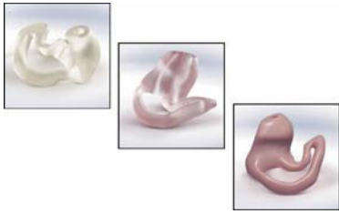
Fig. 6. Objet's Hearing Aid Materials

The following FullCure® materials have medical approvals: