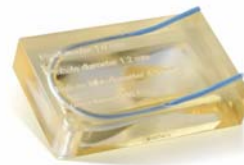
Fig. 5. FullCure® 720 Transparent Model

Its main characteristics are: Tensile Strength: 60.3 MPa, Elongation at break: 15–25%, Modulus of Elasticity: 2,870 MPa, Flexural Strength – 75.8 MPa.