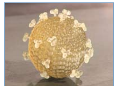
This model of the HI-virus was printed on the Eden 3D printing system. The two parts shown here were printed in a single run, and then painted.